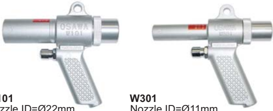
W101 Nozzle ID=Ø22mm